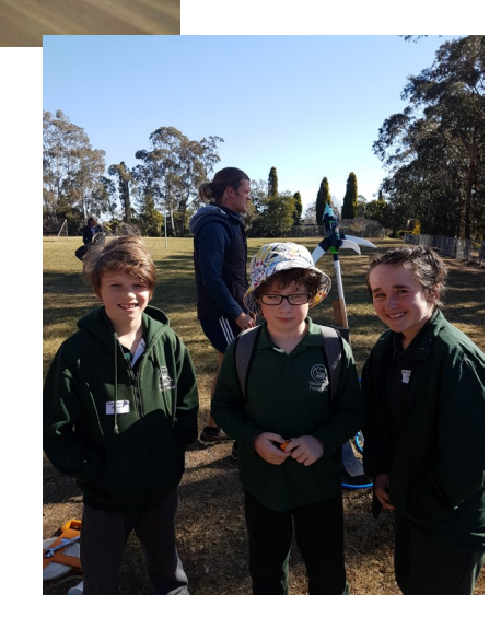
STEM Day Bowral High School