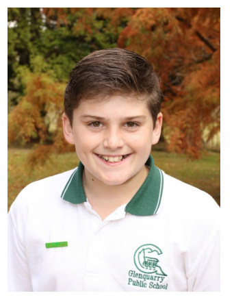
3 to 6 Student of the Week

For his boundless energy and enthusiasm for learning in all its forms.